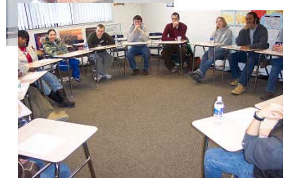
Below: a group of volunteers participating in Justice Talking workshop

The second service project of the day involved the creation of toiletry kits for Rainbow House. Rainbow House works to end domestic violence in the Little Village and Morgan Park neighborhoods. Travel size toiletries were donated by local stores and hotels and then assembled into kits by volunteers. The kits included an assortment of items along with a note written by the volunteers explaining why and when the kits were made.